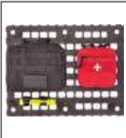
EZ-Click Molle Panel