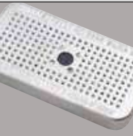
Pelican Desiccant (Silica Gel)