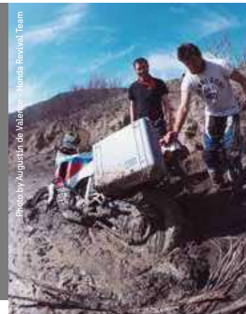
CASE CONTENTS NOT INCLUDED