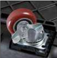
Caster Wheel Kit