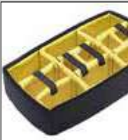
Yellow Padded Dividers